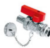
Boiler filling cock self-closing red lever, brass nickel plated