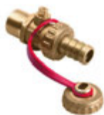
Boiler filling cock recessed brass cap