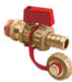
Boiler filling cock red lever self-closing