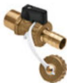
Boiler filling cock black lever